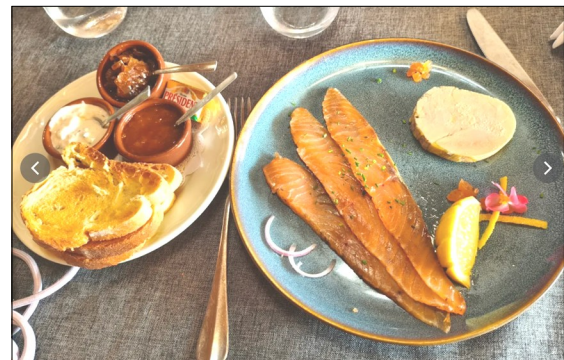
Tandem Salmon Gravlax & Foie gras