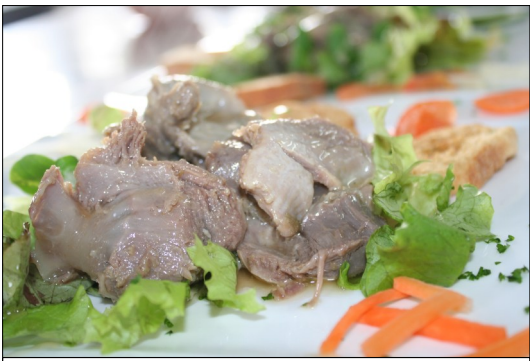
turkey gizzard salad