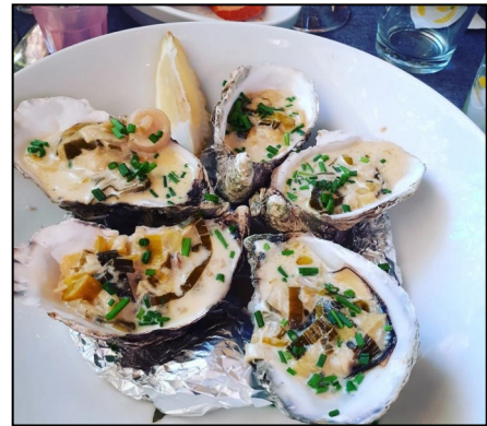
6 hot oysters