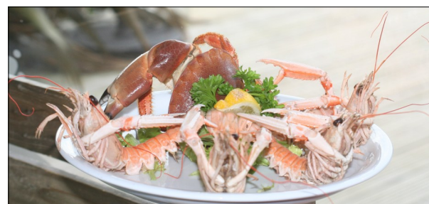
1/2 Crab & Langoustines