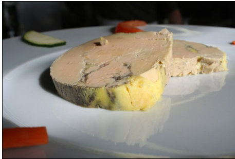
Foie gras mi-cuit « au torchon »