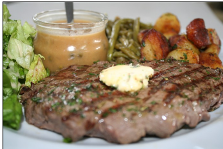
Beef butcher's meat