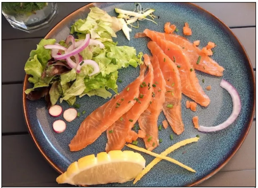
Salmon fillet Gravlax