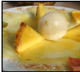
Fresh Pineapple's Carpaccio