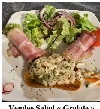
Vendee Salad « Gralaïe »