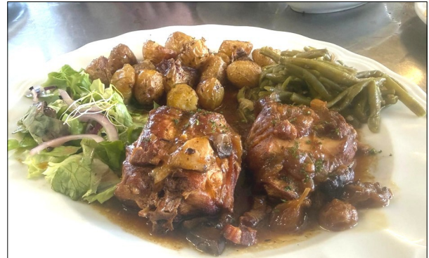
Rabbit "hunter sauce"